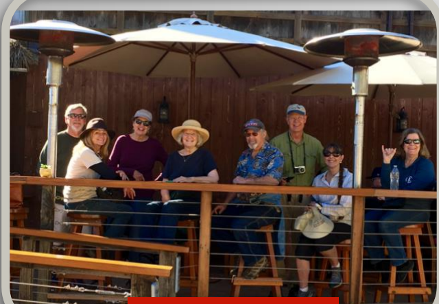
Newport Dunes 2019