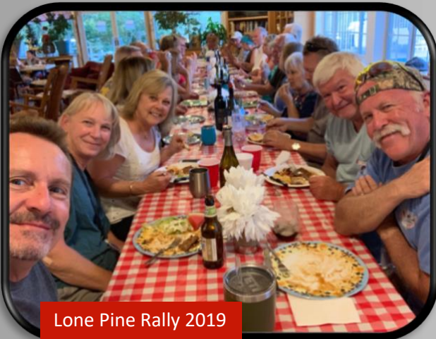
Lone Pine Rally 2019