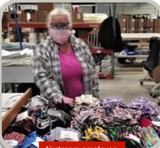
Airstream employee making masks