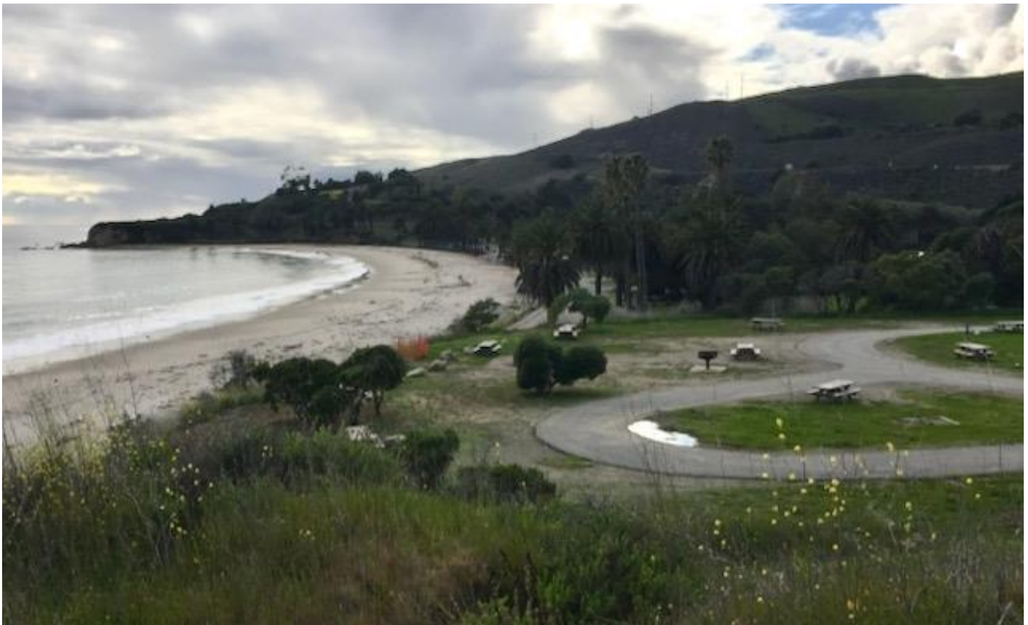
Refugio Group Campground and Ocean Views

The Group Campsite (GBOC) at Refugio has been reserved, arriving on Sunday September 20th and departing on Tuesday September 22nd for our September 2020 CCCU Rally. This will be a “mid-week” rally. If you are interested in attending please notify the Tighes by email or via Facebook. The cost per night would depend on how many sign up for the rally. The cost per night for the group site is $350 plus reservation fees, so if we had 10 trailers, the individual cost would be $36 per night, 8 trailers would be $45, 12 trailers would be 30$ per night, etc. The rally fee would be determined once the hosts have a chance to plan the meals. And, for those who wish to stay longer, there are individual sites available on September 22nd, 23rd, 24th, but don't wait if you wish to extend; you are only out the $7.99 reservation fee if you cancel. When the date gets closer, assuming the COVID-19 restrictions have been lifted, information will be distributed about the cost, possible potluck plans and more.