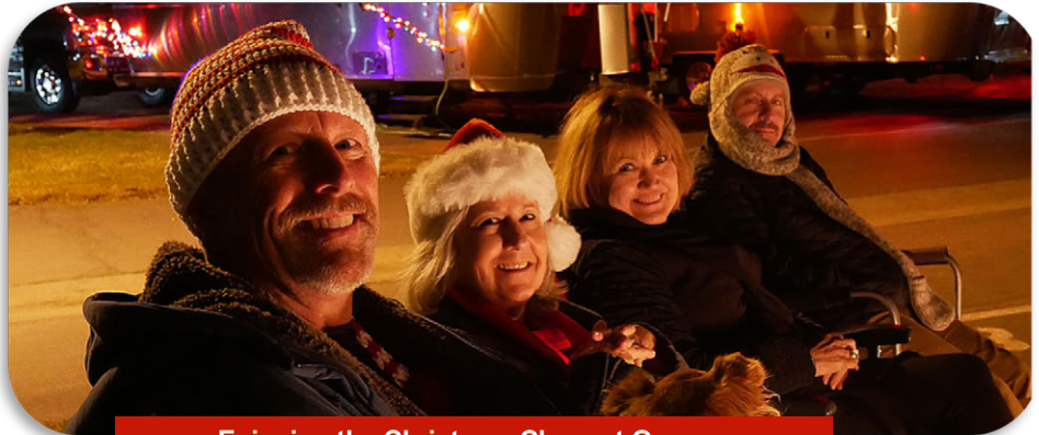
Enjoying the Christmas Cheer at Oceano

Lots of great times are ahead for 2019! Hope to see you there!