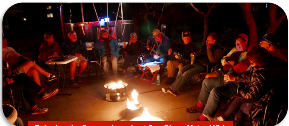
Enjoying the fires and music at San Diego Metro KOA