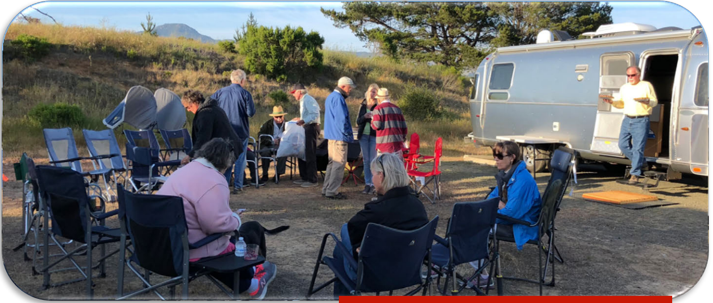
Volunteer & Co-Host a Rally in 2019