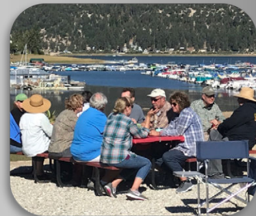
Socializing around the table at Holloway's RV Resort overlooking the Lake