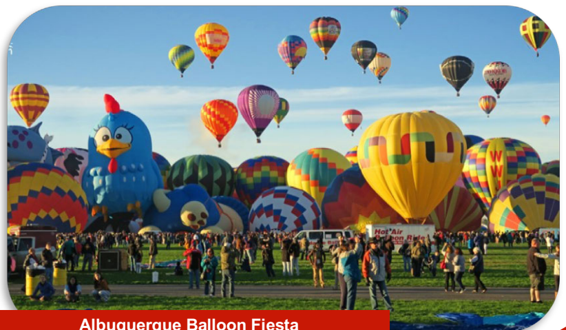
Albuquerque Balloon Fiesta