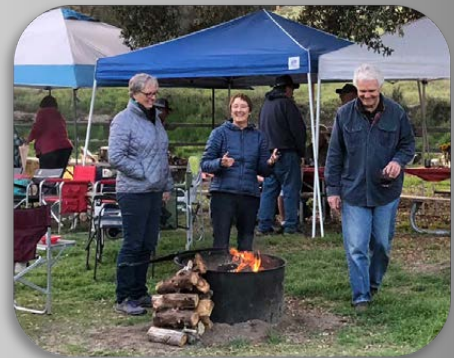
A fire and great friends and even a little rain made an excellent rally!