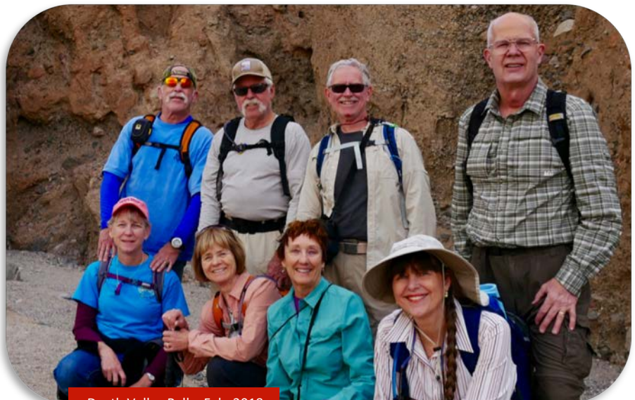
Death Valley Rally, Feb. 2018