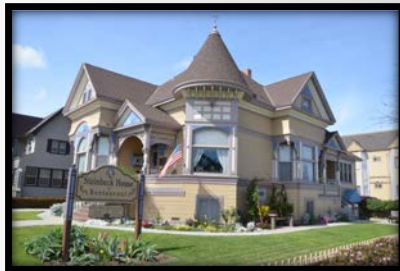
John Steinbeck House