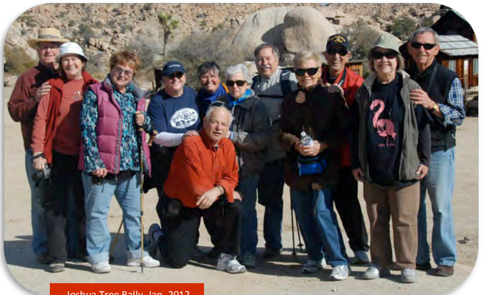
Joshua Tree Rally, Jan. 2012