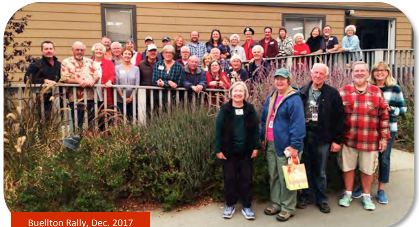
Buellton Rally, Dec. 2017

I had a successful second hip replacement in December and am looking forward to better movement and active CCC participation in 2018. Another thing I look forward to this year, is spending more time playing with my granddaughters. The 4 ½ year old is riding her bike and I have to keep up with her.