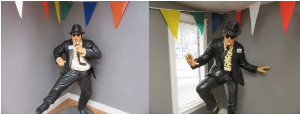
The Unit had two unknown members sneak into the clubhouse. They said they were from Chicago, but booked an event at Jackson Center in Ohio.