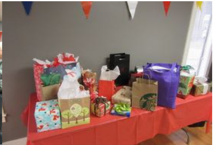
Neatly wrapped presents await the annual gift exchange