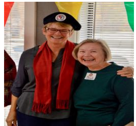
Passing the torch