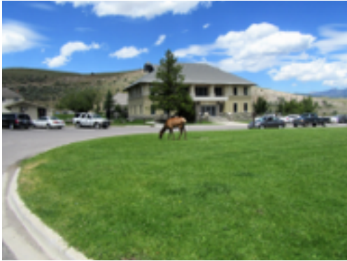
Elk imported from Elkhart, Indiana

Again, visitors were cautioned from getting too close to any of the wild life at Yellowstone. Why they are called wild life, I really don't know. Maybe they have really wild parties at night, kind of like Airstreamers. Still, we did not find any of them with lampshades on their heads. So maybe, they are only semi-wild animals. But you can see for yourself what magnificent animals they are. Saves Yellowstone the cost of lawn mowers too.