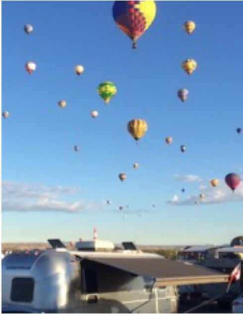
Waking up to balloons overhead.