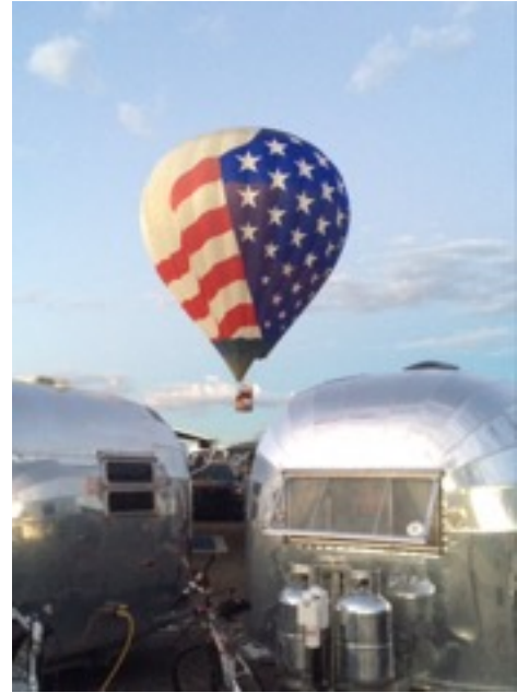
Balloons over Mary's rig.