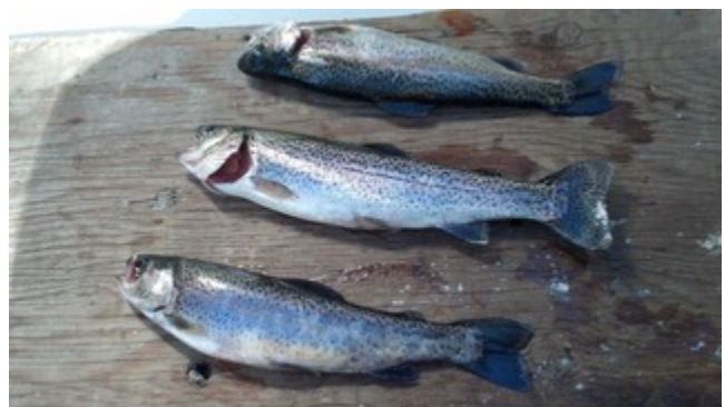
Trout from Twin Lakes