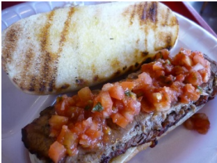
Santa Maria Barbecue

Great places to eat along the way or where you are at a rally!