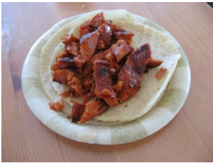
La Super Rica