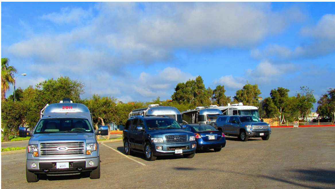
More of those silver trailers prominent at Rallies